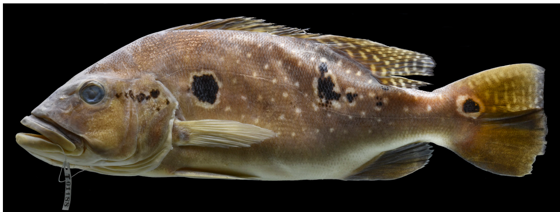
Fig. 3. Cichla cataractae , Holotype, CSBD F 3613, tag T01188 [ex. UMMZ 250942] (308.0 mm SL, female). Guyana: Rupununi River off of Manaho Lagoon, 3°59'33.8"N 58°44'45.8"W.

Diagnosis .— Cichla cataractae , n. sp., is distinguished from all congeners by unique aspects of coloration (Figs. 3–5). In juveniles (<150 mm SL), pattern on sides of body generally dominated by series of three prominent dark blotches. Anterior one below anterior base of spinous dorsal fin (K&F marking 1); posterior one below soft dorsal fin (K&F markings 2a to 4); caudal blotch spanning rear margin of peduncle and finishing on base of middle caudal-fin rays