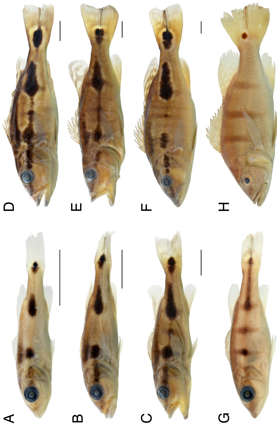
Fig. 4. Juvenile specimens of Cichla cataractae, n. sp. (A–F) and Cichla ocellaris (G–H) from Guyana. A. ANSP 205693 (27.9 mm SL). B. ANSP 177097 (42 mm SL). C. ANSP 177097 (60.7 mm SL). D. ANSP 177095 (86.4 mm SL). E. ANSP 177100 (104.0 mm SL). F. ANSP 176029 (137.7 mm SL). G. ANSP 176032 (37 mm SL). H. CAS ex. 20729 (144.5 mm SL). A, E, F, G from Essequibo River upstream of Kurupukari; B–D from Burro Burro River, Water Dog Falls; H, from Essequibo River at Rockstone. Scale bar = 1 cm.