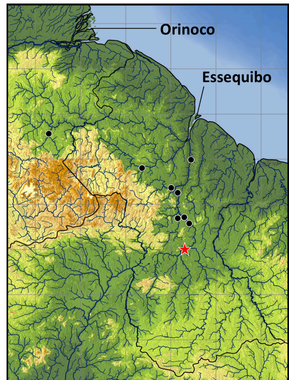
Fig. 7. Distribution of Cichla cataractae , n. sp., in the Essequibo Basin. Star denotes type locality. Base map by J. Armbruster.

Kullander and Ferreira (2006) also proposed a clade composed of C. jariina , C. pinima , C. temensis , C. thyrorus and C. vazzoleri that was diagnosed by two putatively unique aspects of color pattern: presence of light spots along the sides in regular rows and presence of ocellated vertical bars. Willis et al. (2012; 2013) expanded that clade to include C. melaniae , C. mirianae and C. piquiti . Once again, the molecular data failed to support the monophyly of species within the expanded clade, with the notable exception of C. temensis . A follow-up molecular study (Willis, 2017) firmly expanded C. pinima to include nominal species C. jariina , C. vazzoleri and C. thyrorus (i.e., Cichla pinima sensu lato ), but noted this group as paraphyletic with some members more closely related to C. melaniae , C. mirianae and C. piquiti .