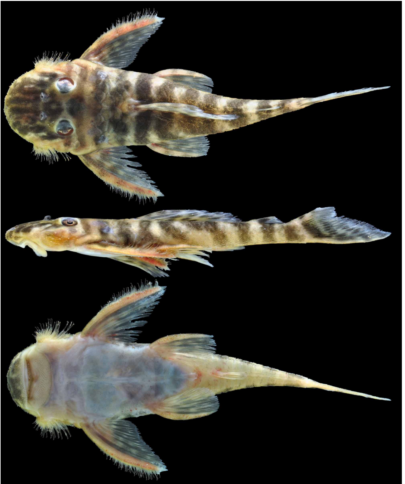
FIGURE 1. Holotype of Pseudolithoxus kelsorum n. sp., 66.0 mm SL, MCNG 55357, Venezuela, Amazonas State, Orinoco River at Merey, 97.6 km N of San Fernando de Atabapo, 4°55'04"N, 67°49'58"W, J. Birindelli, N. K. Lujan, & V. Meza, 18 April 2010 (photographed alive).

Dorsal fin II,7; dorsal-fin spinelet small but visible, V-shaped; dorsal-fin lock functional; posteriormost dorsal-fin ray free from body. Pectoral fin I,6; adpressed pectoral-fin spine reaching approximately halfway between anus and pelvic-fin origin; anterodorsal surfaces of spine with many hypertrophied odontodes increasing in length distally; odontodes longer and more numerous in larger specimens. Pelvic fin I,5; pelvic-fin spine extending to or past