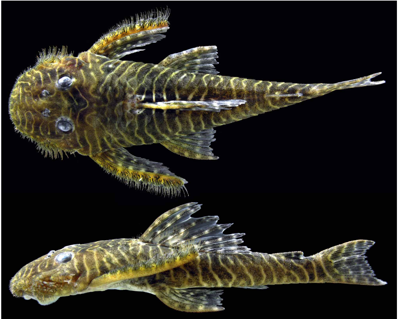
FIGURE 2. Pseudolithoxus tigris , 70.4 mm SL, AUM 42110, Venezuela, Amazonas State, Orinoco River, 50 km E of San Fernando de Atabapo, 4°55'04"N, 67°49'58"W, N. K. Lujan et al. , 3 March 2005.

insertion of anal fin when adpressed. Anal fin I,4; second unbranched ray longest. Adipose-fin spine straight; adnate to caudal peduncle via fleshy membrane with concave or convex posterior margin. Caudal fin I,14,I; dorsal procurrent caudal-fin rays four; ventral procurrent caudal-fin rays four; caudal fin obliquely and asymmetrically emarginated, with ventral lobe longer than dorsal lobe.