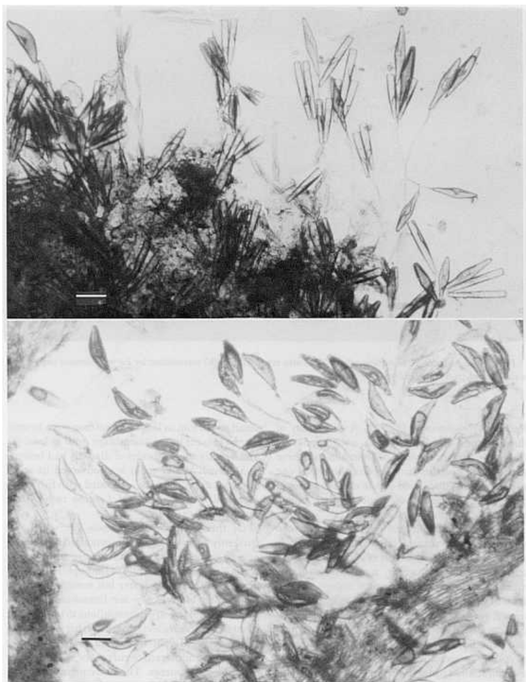
FIG. 2—Microphotographs showing stalked diatoms (scale = 50 \mu\text{m} ). Upper photo: Gomphonema dominated assemblages attached to copepod body. Lower photo: Cymbella assemblage anchored to Nitzschia tubes.